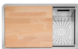
Beech chopping board CCB3 [sold separately]