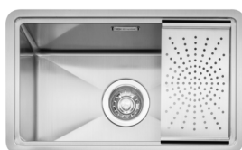
Stainless steel colander

Each sink includes a steel colander, cup stand bottle holder and the CCB3 wooden chopping board [sold separately] is custom designed to fit the bowl perfectly.