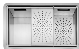
Stainless steel colander, cup stand and bottle holder